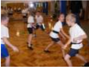
Year 3 learning TAG Rugby