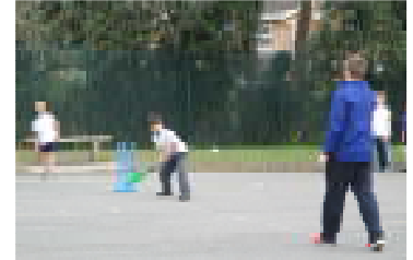
Year 4 enjoying cricket coaching.