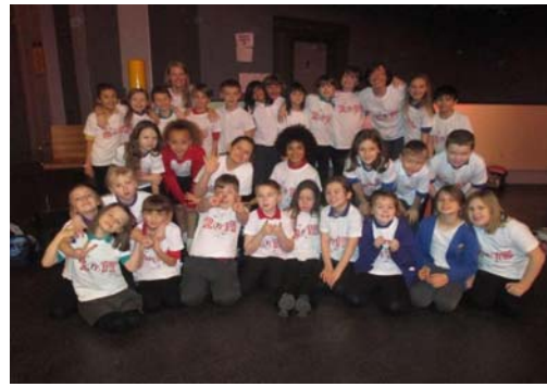
Young Voices 2015

As part of curriculum enhancement pupils from 4H have been learning to play the cornet. Lessons culminated in a performance for parents and carers on Friday 30th January. All who attended were very impressed and thoroughly enjoyed the upbeat numbers performed.