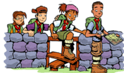
The Great Outdoors