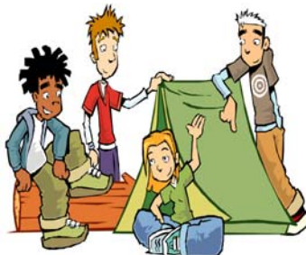
I love camping